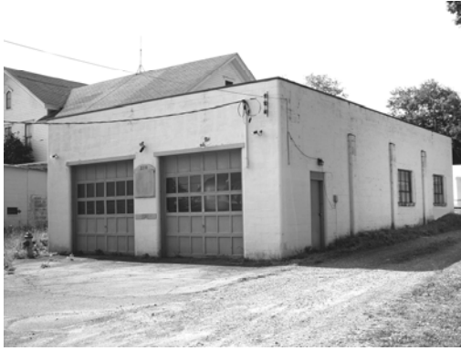
2218 Penfield Road