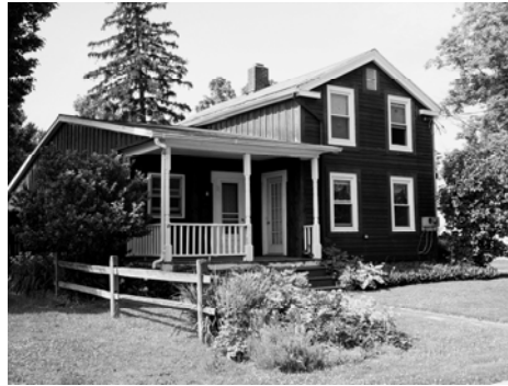
2212 Penfield Road