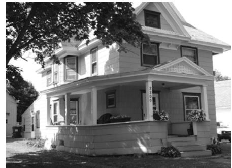
2200 Penfield Road