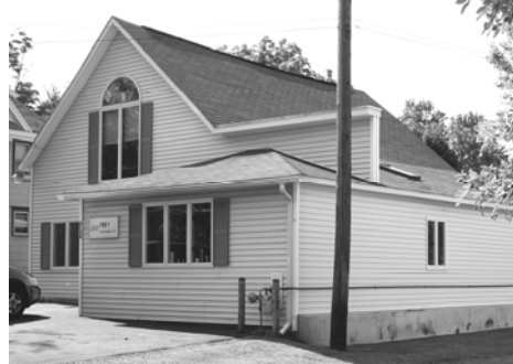
2194 Penfield Road