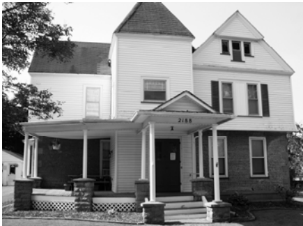
2188 Penfield Road

NOTE: House numbers throughout Wayne County were changed in the mid 1970's for simplification and emergency response purposes. The numbers in parentheses are the original numbers that are no longer used. The road was originally called Town Line Road or Rochester Road.