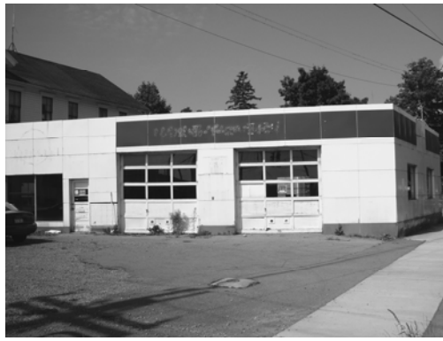
3719 Walworth-Palmyra Road

2218: 2 nd fire house: When another fire truck was purchased in 1950 it became apparent that a larger fire house was needed, and the fire department purchased land to the east of #2216 from the Walworth Grange . A water cistern, storing 25,000 gallons of water for fire protection, was also constructed under the floor of the new building. Current owner William Thompson purchased it in March 2002.