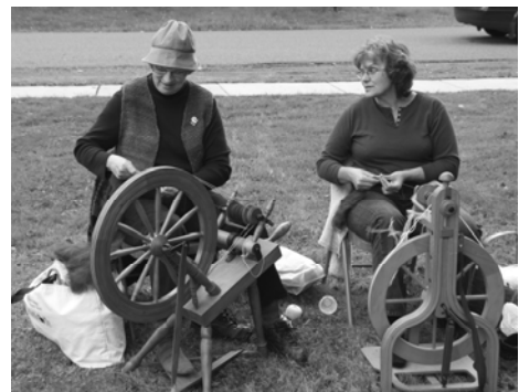
The above are scenes from the WHS open house held on October 8 th