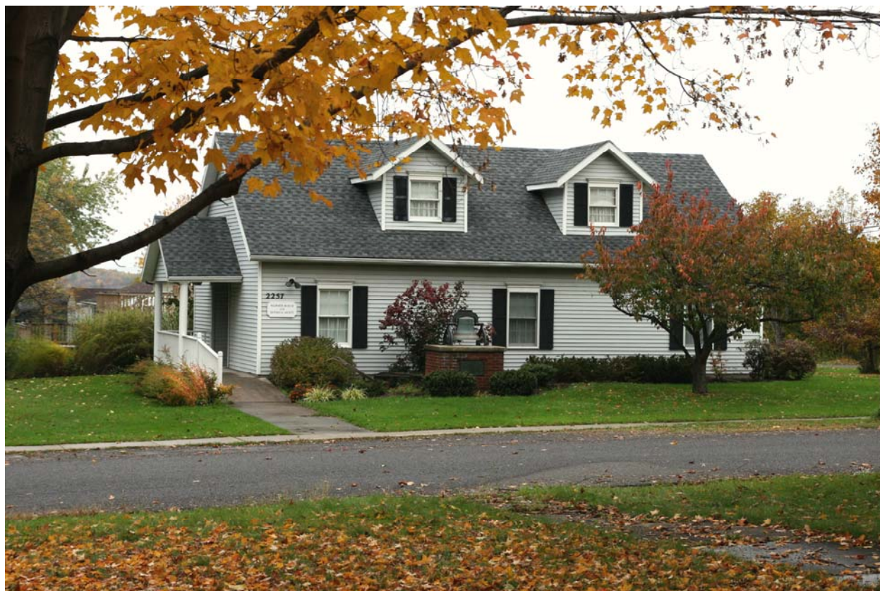
Walworth Museum 2257 Academy Street