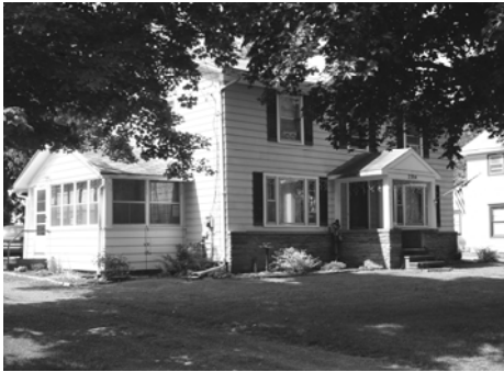
2204 Penfield Road