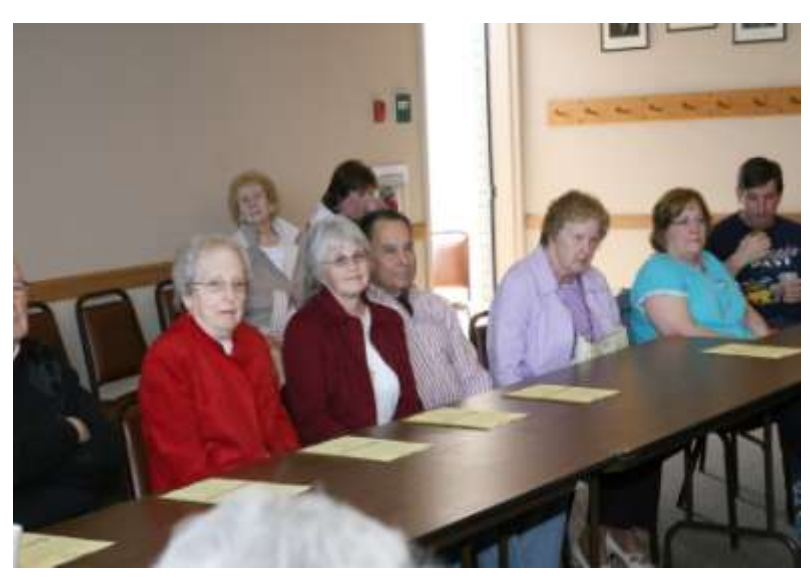
Above: on April 19.