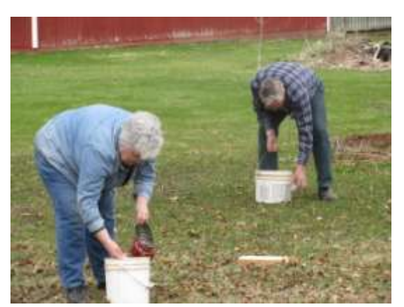
Fertilizing the beech tree