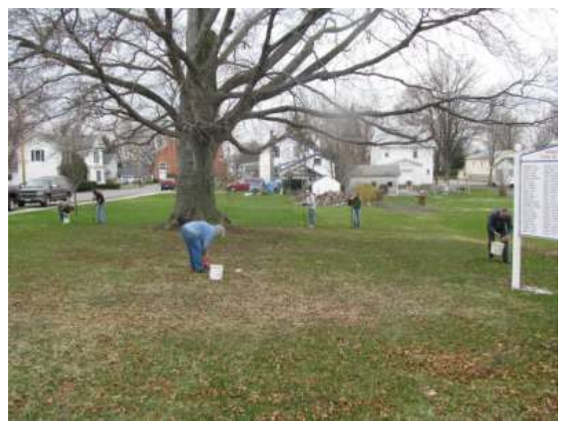
<u>Left:</u> Members and volunteers fertilize the copper beech tree next to the museum.