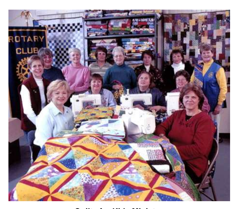
Quilts for Kids Ministry

Following the meeting, the Walworth Historical Society will present the Community Service Award to Quilts for Kids, a local organization that has a mission of providing quilts to children in Third World countries who have been hospitalized. During surgery, each child is wrapped in a quilt and they take it home with them. Previously post-surgery children were wrapped in paper and plastic due to lack of blankets. The group is affiliated with the Zion West Walworth United Methodist Church.