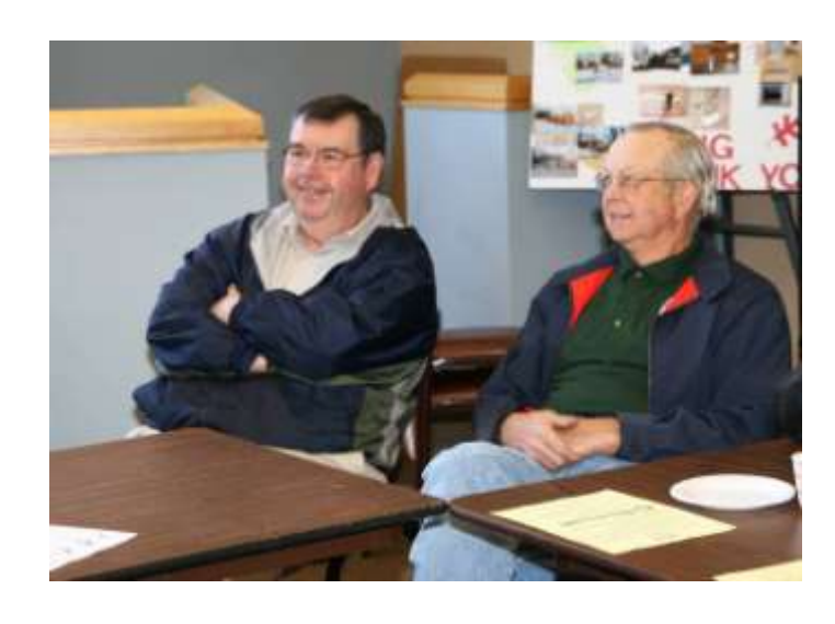
WHS May 2010 Newsletter (page 9)