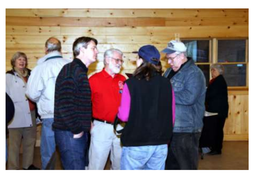
WHS May 2010 Newsletter (page 10)