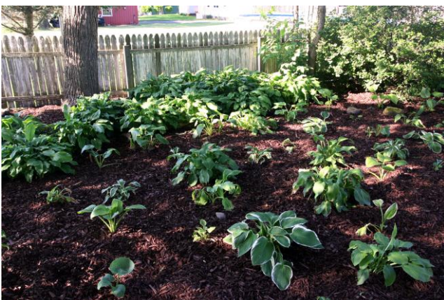
Hosta garden at the WHS museum