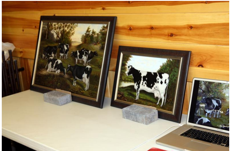
Top left: Uniform donation to the museum