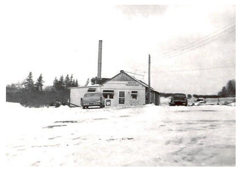
Outside Cring's restaurant 1959

As you drive on our country roads, you'll soon see buckets hanging from the maple trees. If you stop and listen carefully, you'll hear the drip, drip, drip into the bucket. It's time for pancakes!