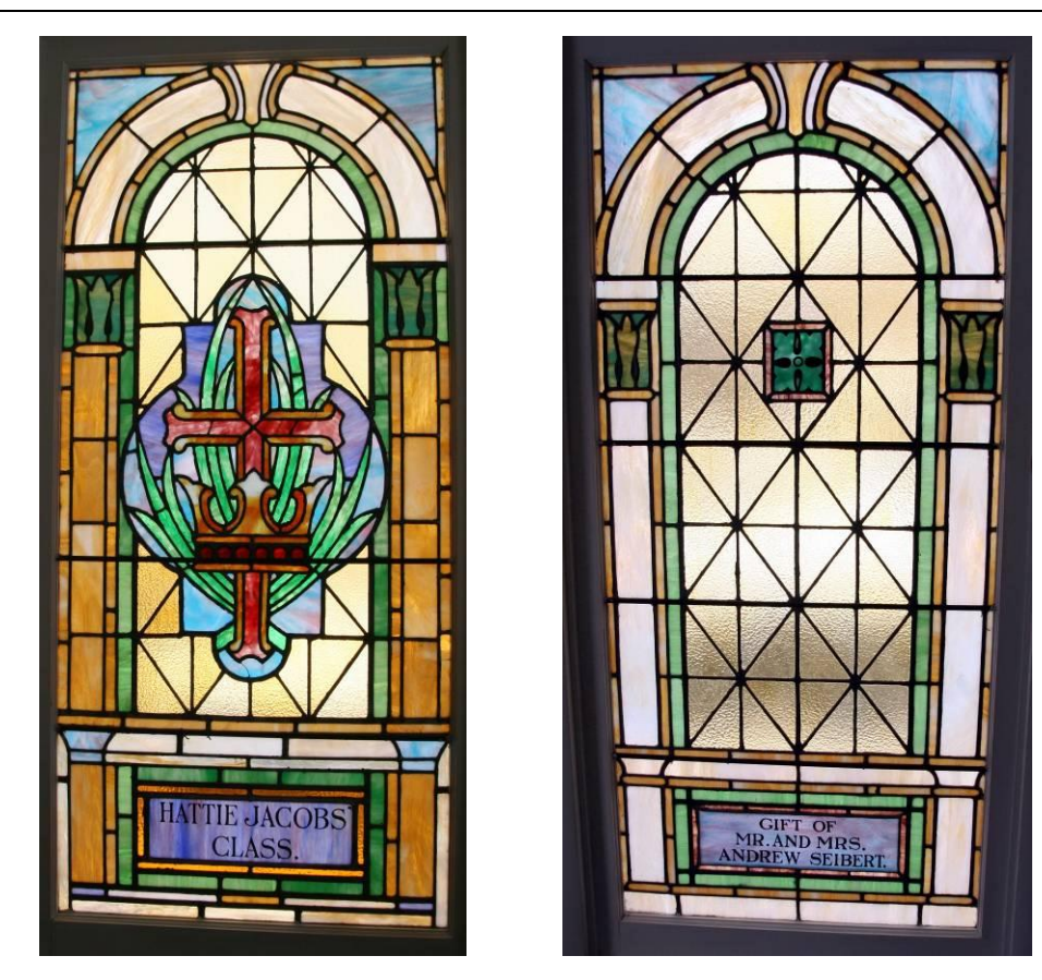
Stained glass windows in the West Walworth First Baptist Church