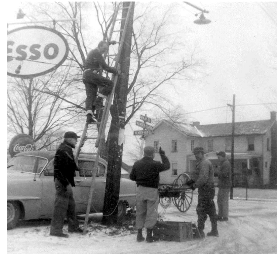
Walworth Christmas 1957