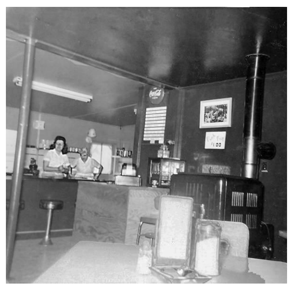
Inside Cring's restaurant 1959