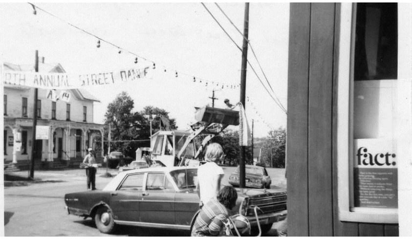
14<sup>th</sup> Annual Walworth Street Dance