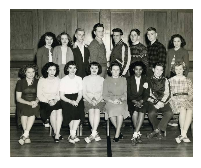
Walworth High School - Class of 1949