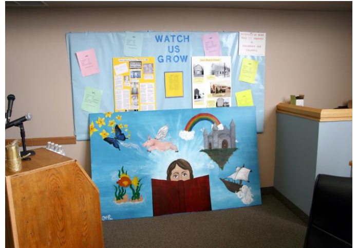
(below): A library display and a special painting