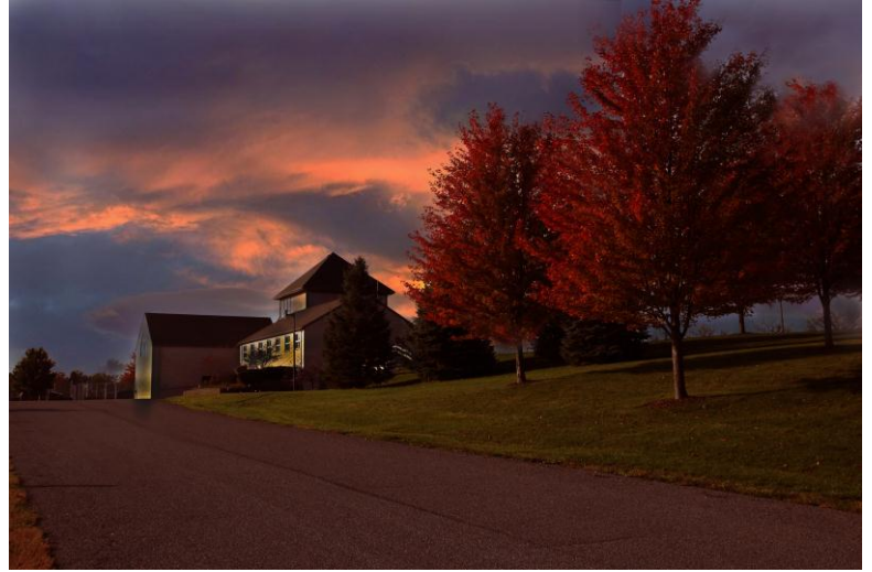
Evening at the Walworth Town Hall