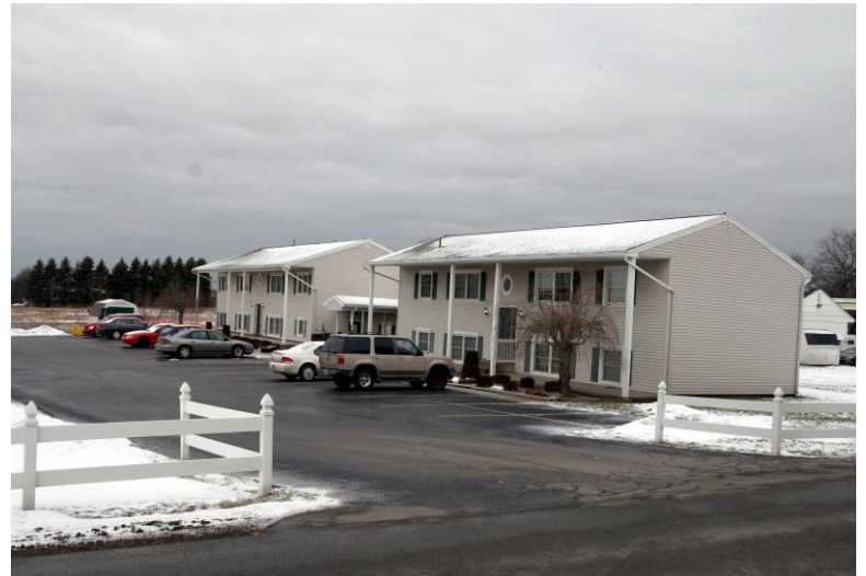
Walworth Apartments on Church Street