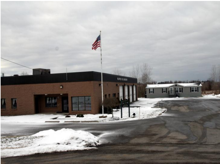
Walworth Fire Hall and new ambulance base