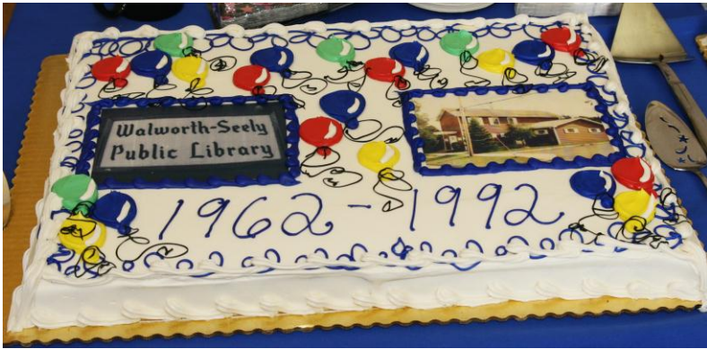
(left): Wegmans cake close-up

(All photos on this page are from the 50-year Walworth-Seely Public Library celebration)