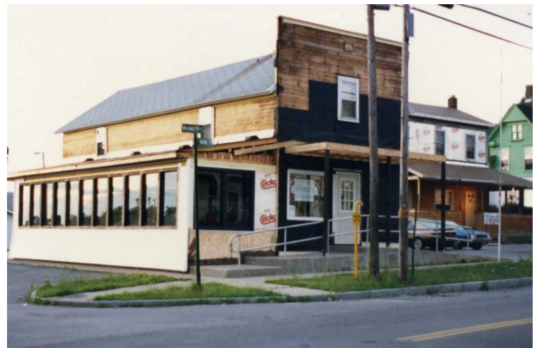
Building the Walworth Laundromat 1987