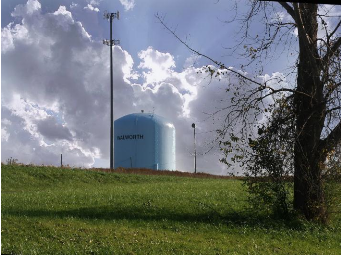
Walworth water tower