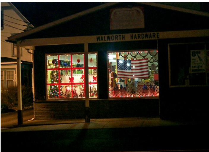
Walworth Hardware decorated for Christmas