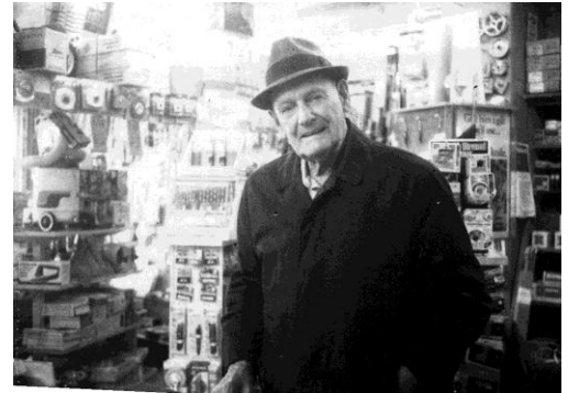
(top): Herland at Walworth Hardware