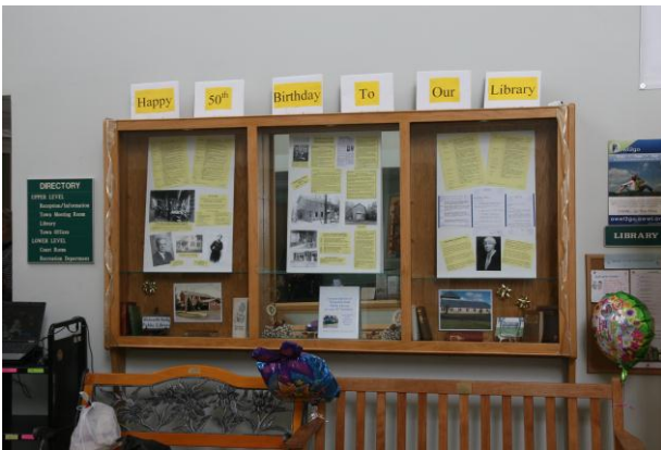
Walworth Town Hall lobby display case

The two sheet cakes seen on the front cover of this newsletter, were decorated with a photo of the 1984 library building and signage and the current facility and signage at the town hall complex. Also on display was the original sign that was attached to the front of the first library and is now the property of the Walworth Historical Society.