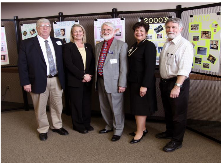
(bottom left): US Congresswoman Ann Marie Buerkle (second from left)