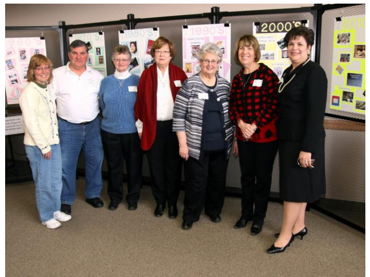
Members of Friends of WSPL