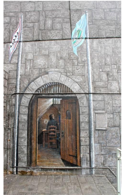
All photos on this page are murals from other areas.