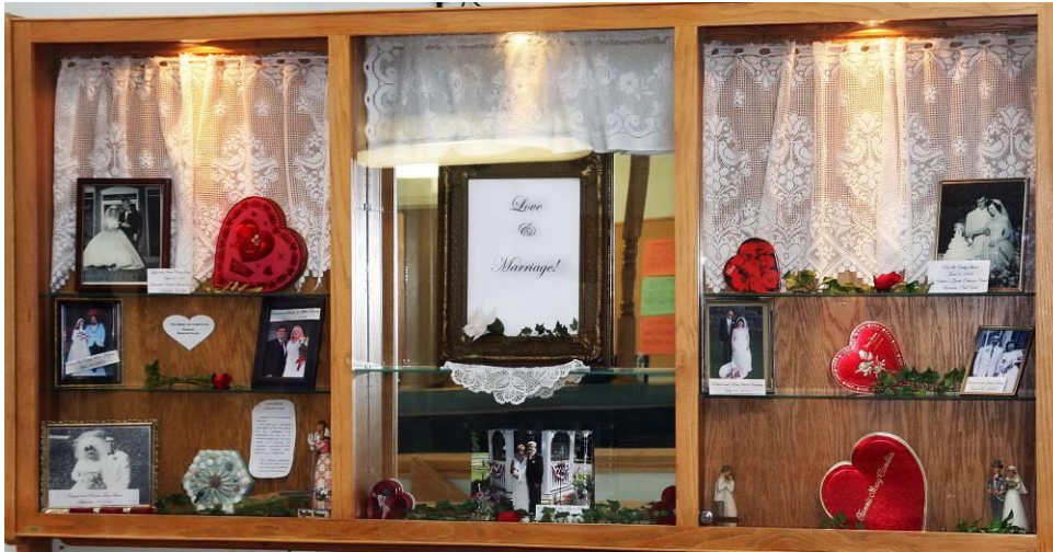
The Valentine's Day display of wedding photos at the Walworth Town Hall.

"...and what is so rare as a day in June - then if ever come perfect days." Walworth Historical Society is again celebrating the month of June and love and marriage by displaying photos of local couples in the town hall display case. So far we have displayed over 40 local couples' wedding photos. Do you have one to share? Please contact Judy McMillan at 524-4219 or Dorothy French at 986-1098 if you wish to participate. We can scan your photo and immediately return it to you for safe-keeping. We will then retain the copy for our archive files. Hope to hear from you.