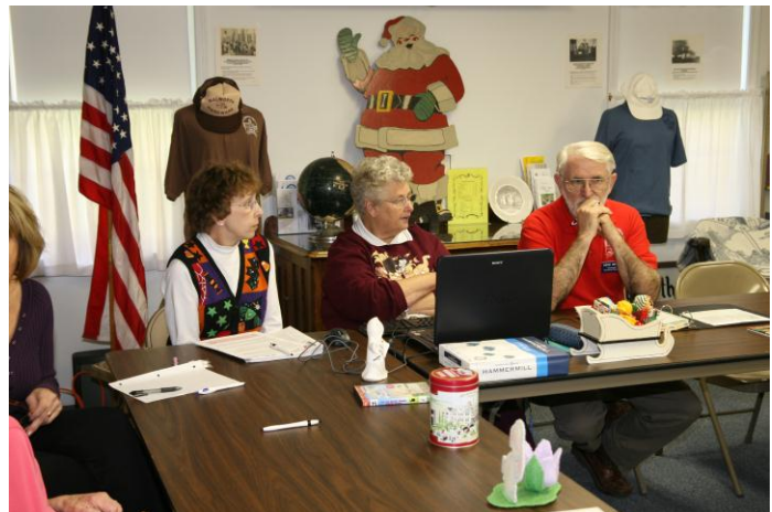
Scene from holiday memories meeting