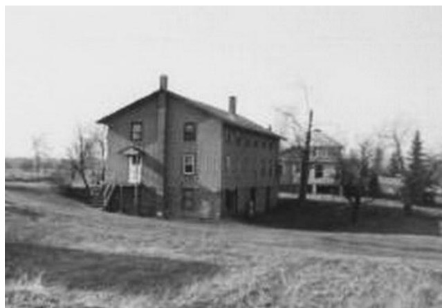
The Lincoln Cheese Factory in the 1960s