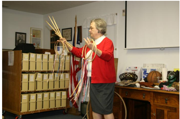
More children's games are demonstrated