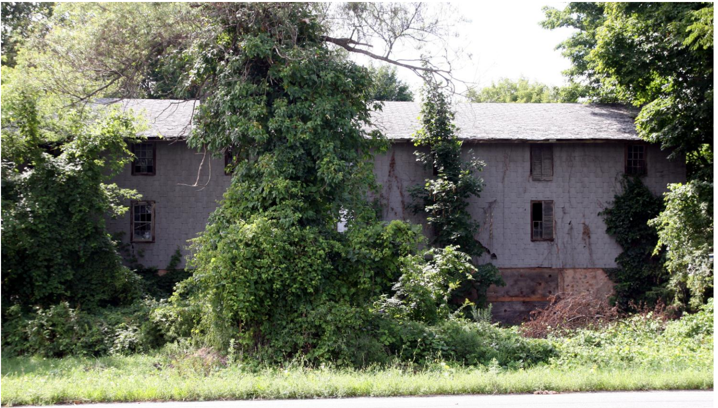
The Lincoln Cheese Factory as it looks today