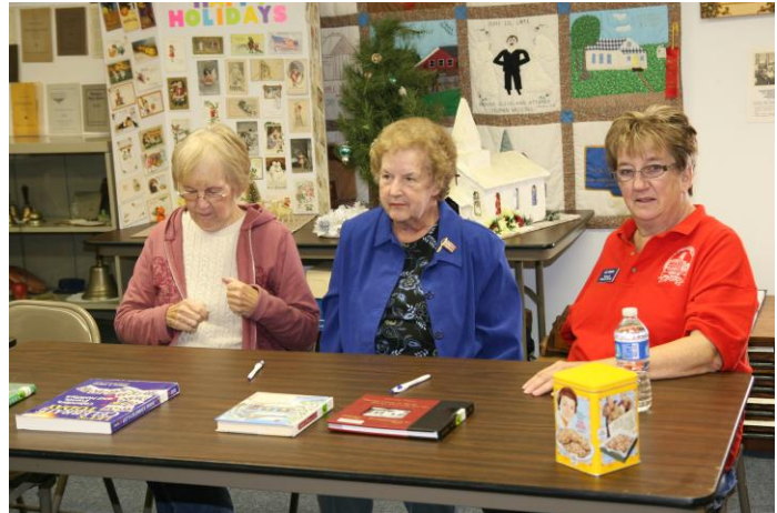
Holiday memories were discussed on Oct. 17