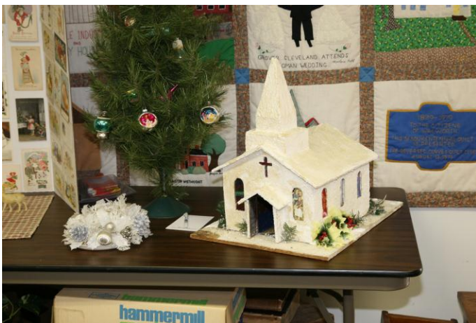
Items displayed at the "Memories" meeting