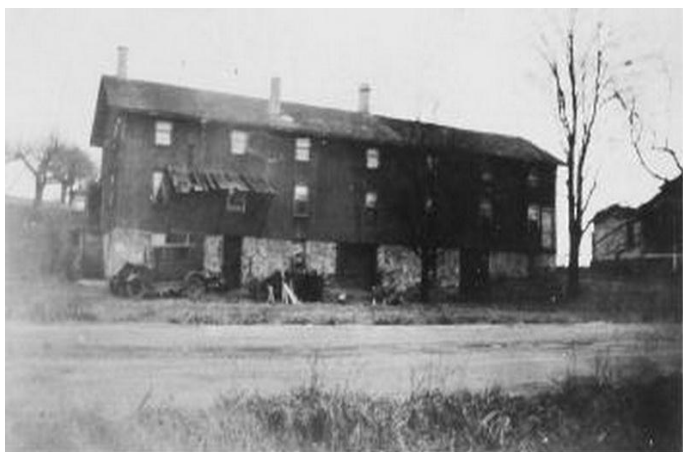
An early photo of the Lincoln Cheese Factory